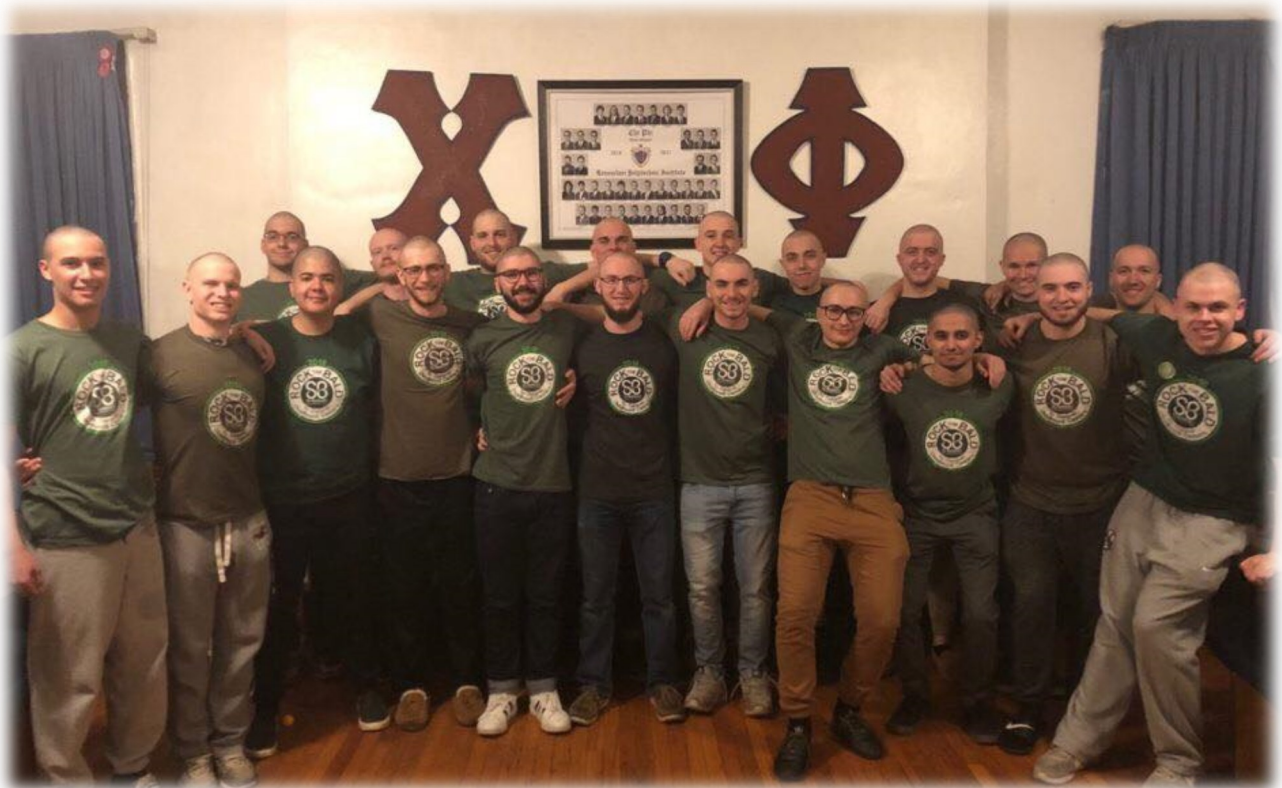
Chi Phi Brothers posing in the dining room after shaving their heads.