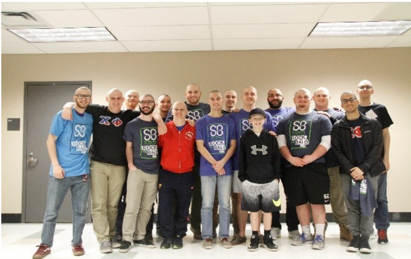
Chi Phi and Theta Chi Brothers and New Members posing with an Honor